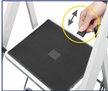
Safety locking mechanism.